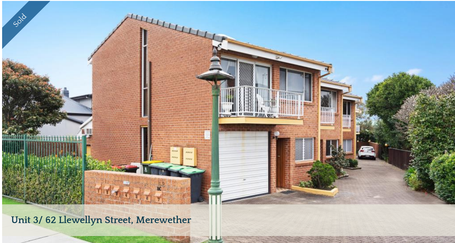
Unit 3/ 62 Llewellyn Street, Merewether