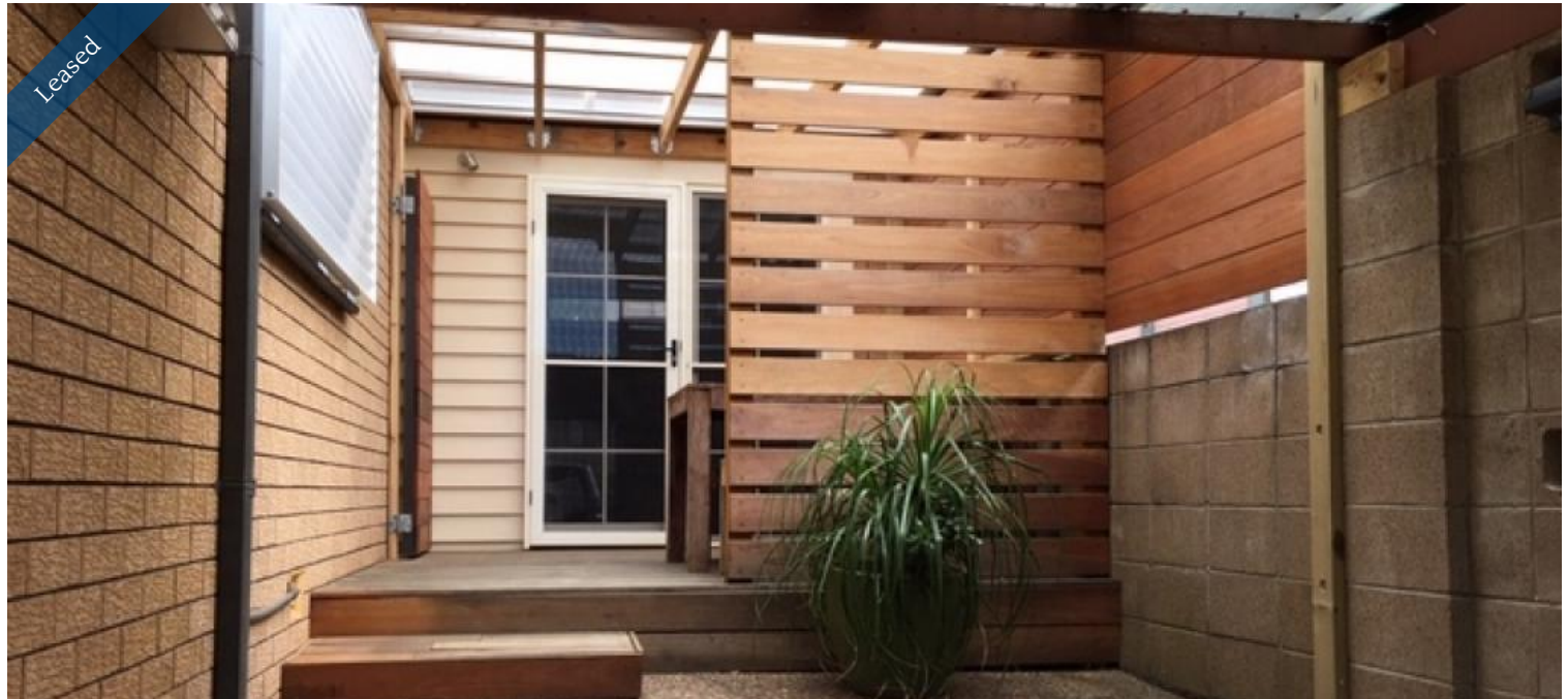
40a Waroonga, Waratah